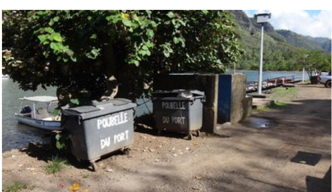
Trash and basic shower