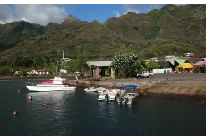
Ladder 1 where the dinghys are Ladder 2 betweeen the motorboats (near the ramp in the corner)