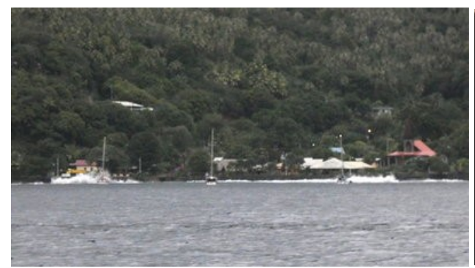
sometimes ugly swell breaking ashore