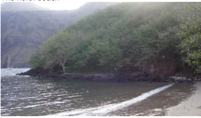
Path to the hamlet (towards the tree)