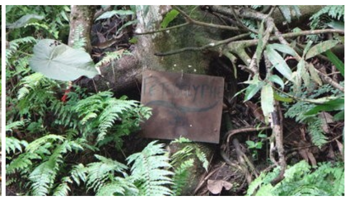
first concrete part uphill - Dagmar shows the way to the sign