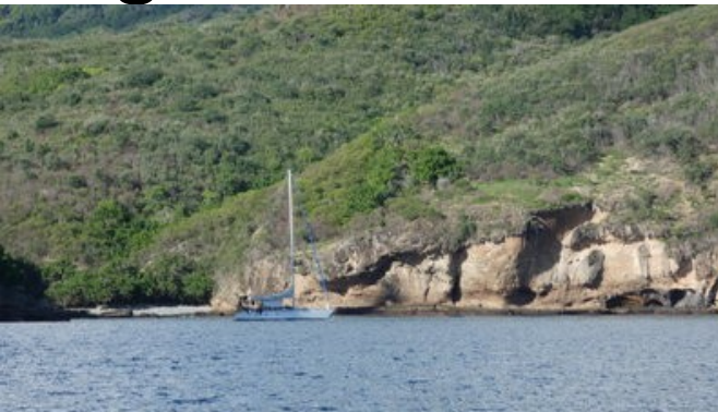
On the east side of the bay are some local buoys.