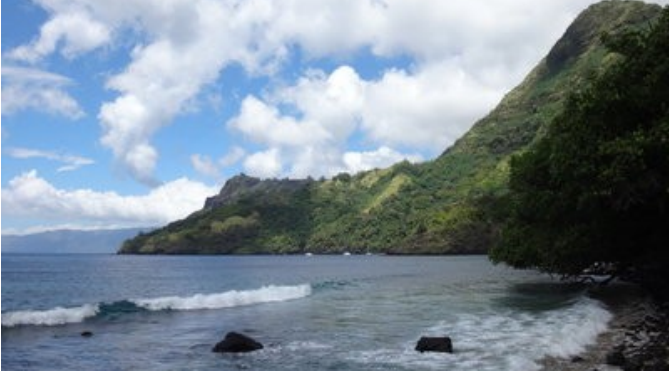
view from Hapatoni