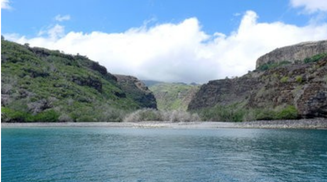
approach from the north