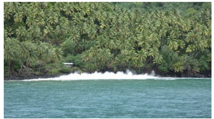
Sometimes southerly big swells