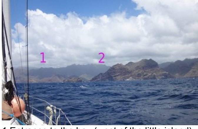
1 Entrance to the bay (west of the little island) 2 Vertical white line in the rock as an indicator

Events: New Years Eve, National Day etc. they host partys at the hall 100m from the touristoccice towards town. It can be a good idea to reserve seats at a table in advance. Walkins get a seat in the last row ("Poisson Crue au lait Cocco" on bastille day was outstanding good !!!).