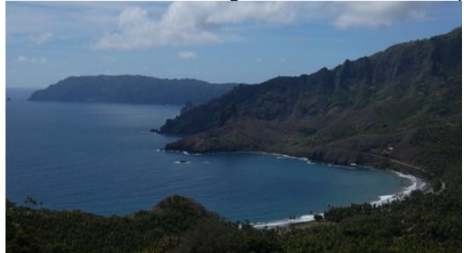
Puamau Bay (looking E)

Historic Site "Me'ae lipona" in Puamau - nice, but not great nor big, an english explanation chart at the entrance. Pay 300XPF p.p. at Snack Therese (we asked if we can harvest some fruits as well and were given instructions to a specific Pampelmousse-tree).