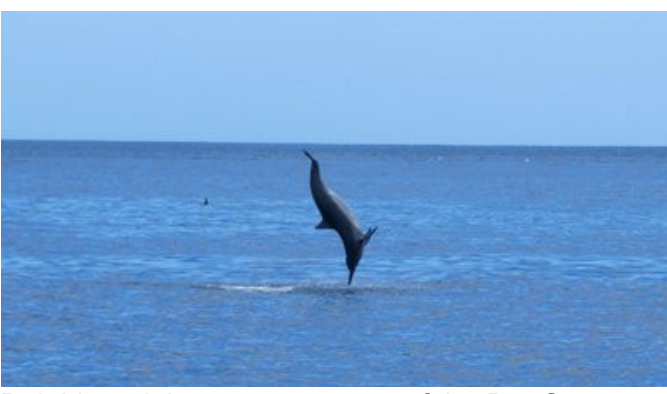
Dolphin-training-center => one of the Pro Group