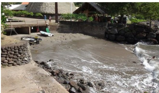
Rivermouth (kids-playground), rocks begin where the surf is (right side seems a bit better)