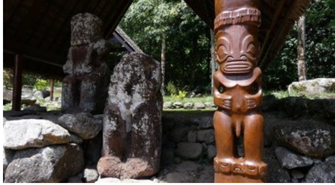
Me'ae lipona - biggest stone tiki outside easterisland (but not in good conditon (the wooden pilar tiki of the roof is new and more attractive:-)