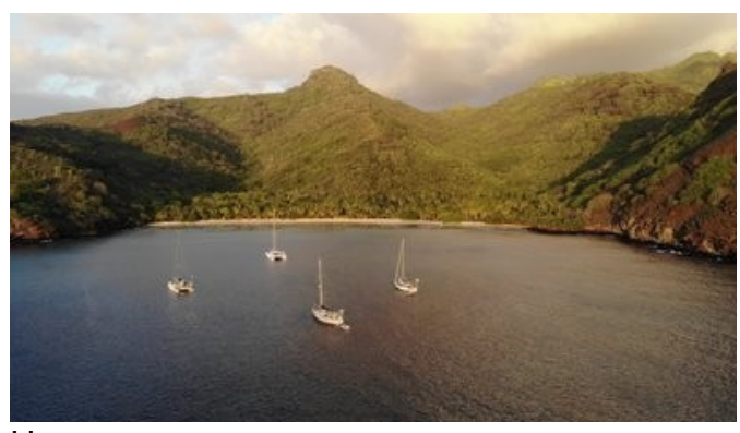
Hanamoenoa