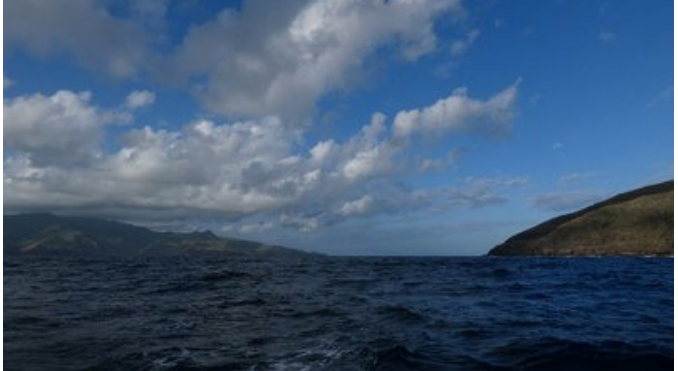
Bordelais-Channel W to E (left Hiva-Oa)