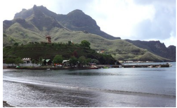
L-shaped harbour + additional wall to the beach In the background the cruise-ship-terminal