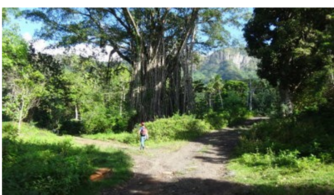
At the Banyan tree turn left