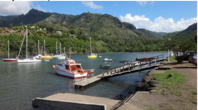
small dock leading to the floating dinghydock (gone in Jan 2019!, hoped to come back?!?)