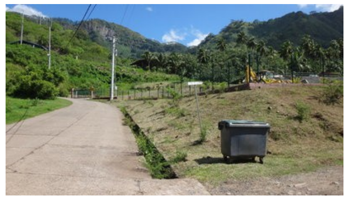
Follow the Road from Magazin Larson up the hill "Koueva" - Signpost (left of the garbage container [not always there:-)] => turn right

Walk description to Koueva (ancient site) (ca. 45 minutes uphill one way)