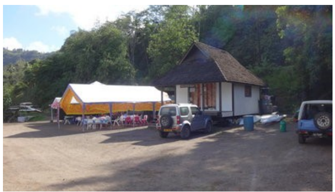
Restaurant and Tourist-info