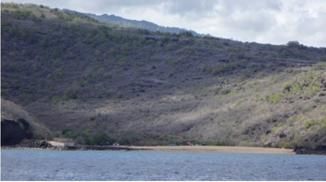
approach from the north