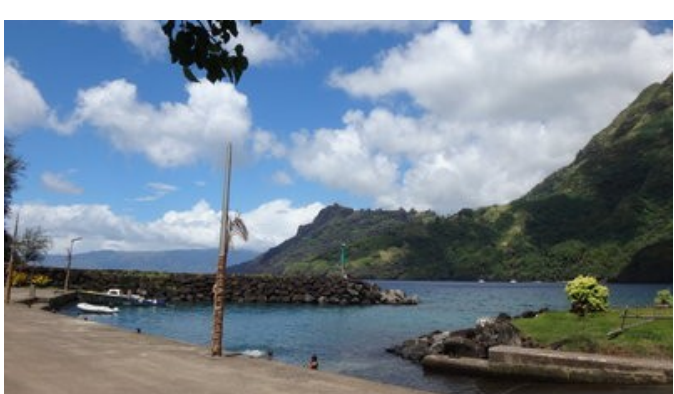
Harbourview towards the village