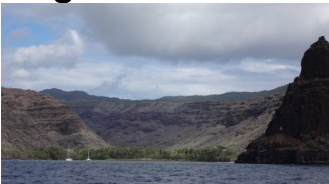
Entrance from the west with the west bay