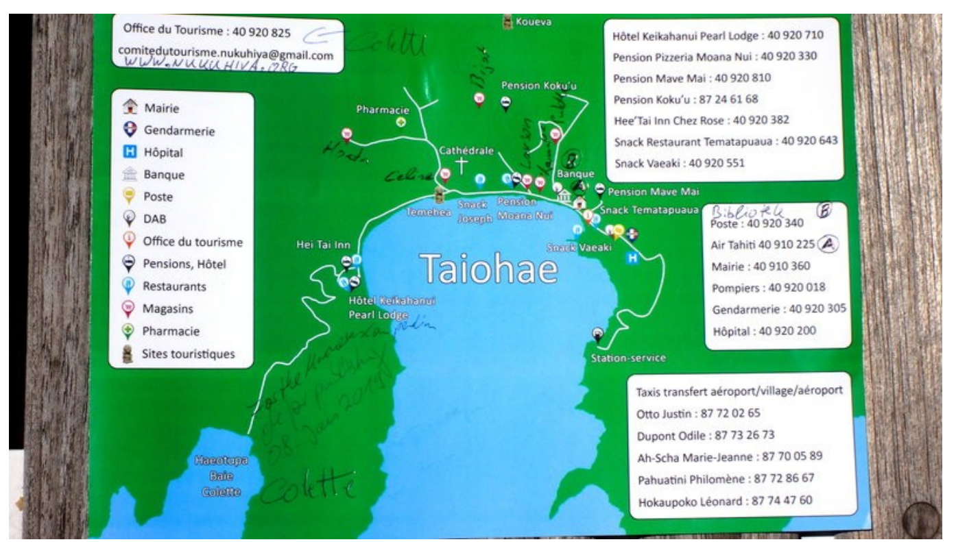
Info-Map from the Tourist-information-office (Colette allowed it to be published in the M-Compendium)