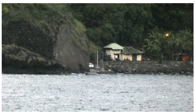
Concrete Landing is left (N) of the bay