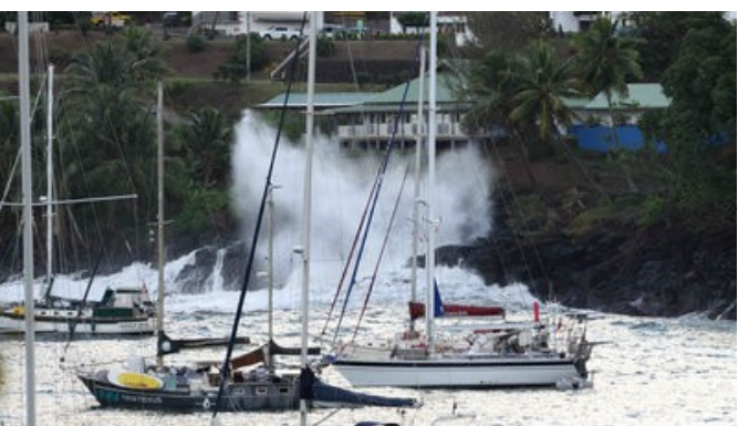
sometimes big southerly swell in the harbour