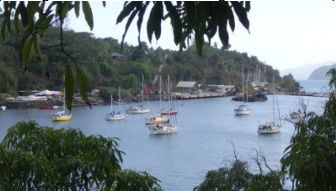
left of the ferry-dock (roof) is the yellow buoy

Anchor behind the line of the rusty yellow pilars to markers on W-shore as well yellow buoy (E) (pilars gone in Jan 2019, but might come back?)