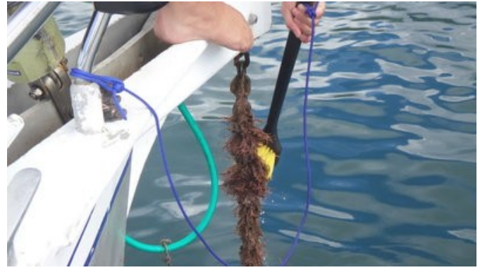
Fouled chain after 3 weeks in January