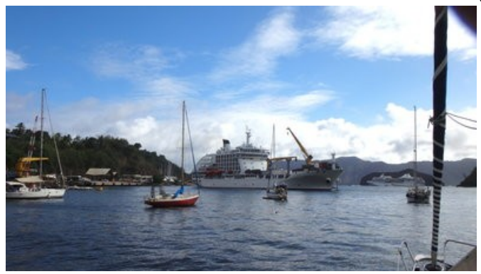
Aranui 5 in the harbour (the background cruiseship stayed outside)