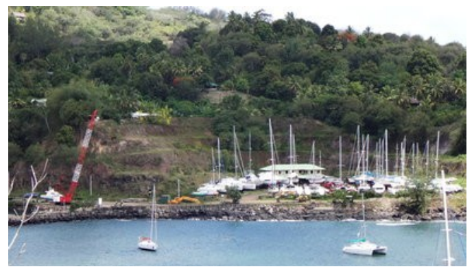
Storage MaintenanceMarquises (SE of the breakwater)