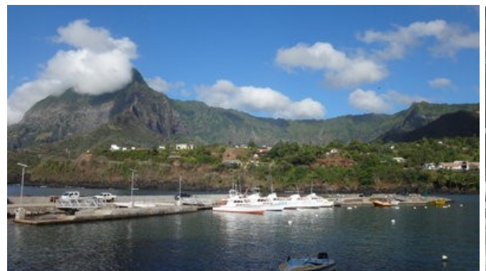
breakwater with med-style-moorings