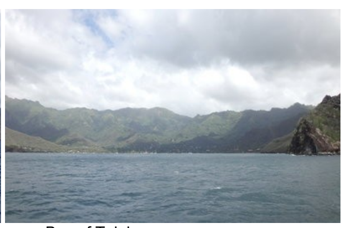
Bay of Taiohae